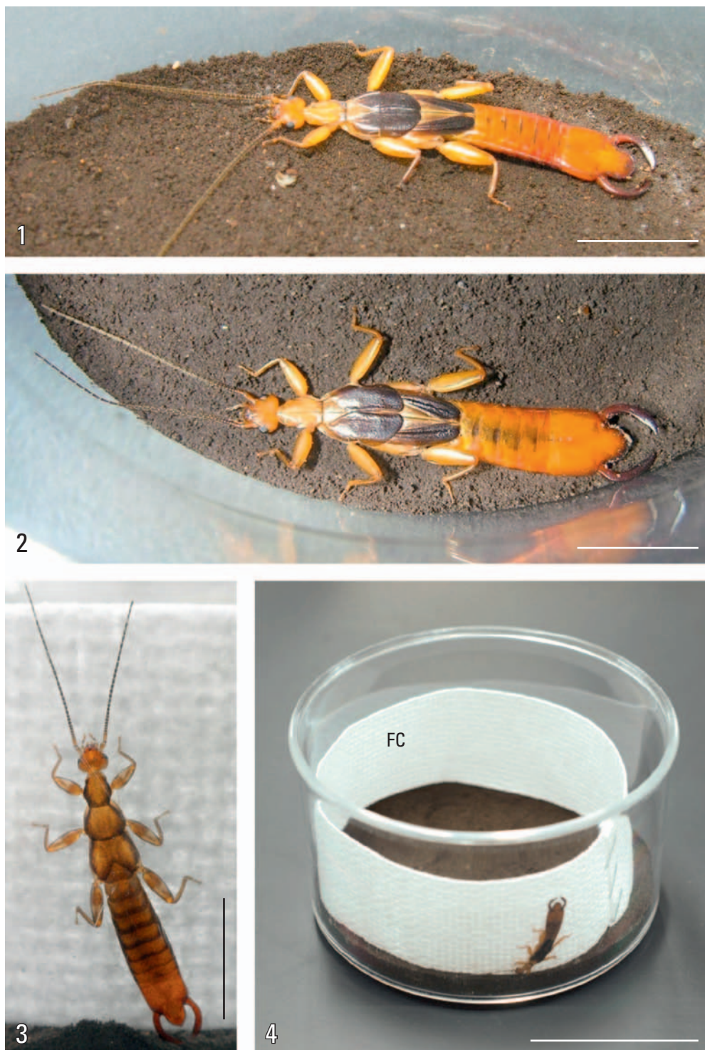
Figs. 1–4. Apachyus chartaceus (de Haan, 1842) and a vessel for rearing it. 1: Male. Scale bar = 1 cm. 2: Female. Scale bar = 1 cm. 3: Ultimate instar juvenile. Scale bar = 1 cm. 4: Rearing vessel. Scale bar = 5 cm. FC = fabric cylinder.

eral eggs on her anal process (Fig. 6); the next day the egg mass was found to fall on the ground, where the eggs remained as a cluster. It is known that females of the higher Forficulina take great care of their eggs and hatched juveniles (overview in MATZKE & KLASS 2005). However, we did not once observe any evidence of active egg-caring behavior of Apachyus chartaceus females.