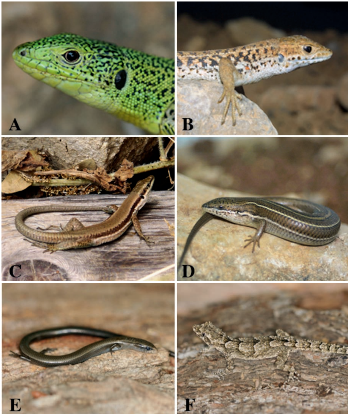
Fig. 3. Reptiles from Dibbeen Nature Reserve. A. Lacerta media . B. Ophisops elegans . C. Lacerta laevis . D. Mabuya vittata . E. Ablepharus rueppellii . F. Cyrtopodion kotschy .