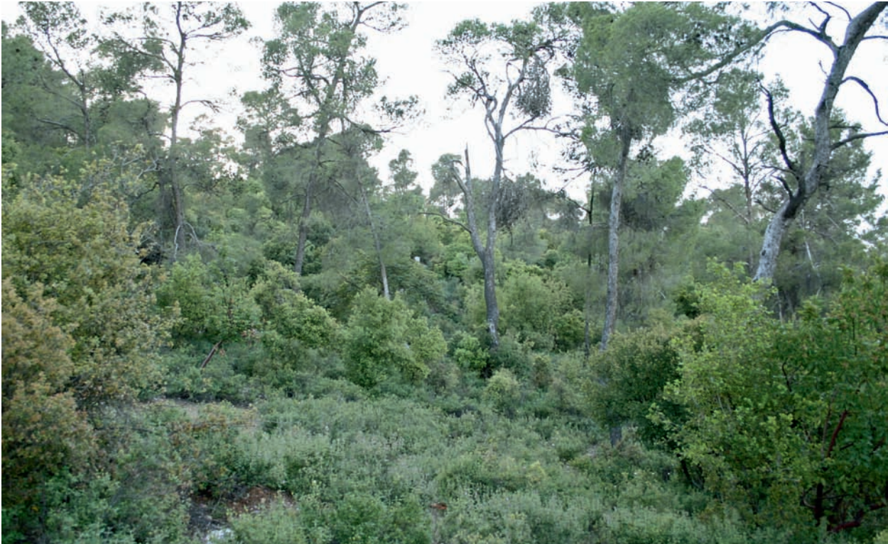
Fig. 1. Habitat of Dibbeen Nature Reserve showing mixed pine and oak trees.

employed differed significantly in detecting amphibian and reptile species at Iwokrama Forest, central Guyana.