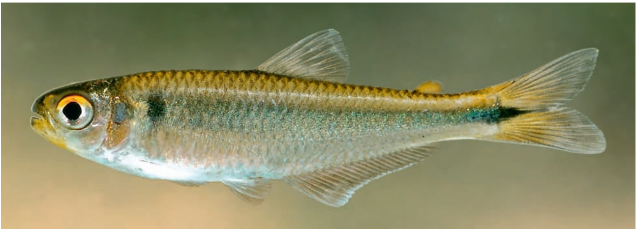
Fig. 4. Bryconamericus guyanensis sp. n., lateral view, not preserved. Tamponc, Maroni, 1998.