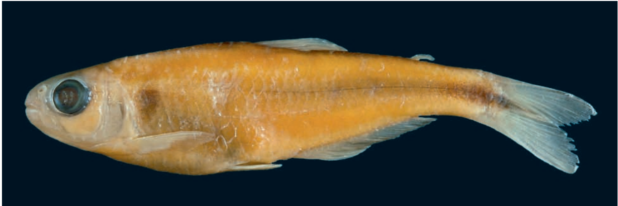
Fig. 1. Bryconamericus guyanensis sp. n., lateral view, 43.2 mm SL, holotype, French Guyana, Mana, crique Eau Claire at 7 km of Saül.