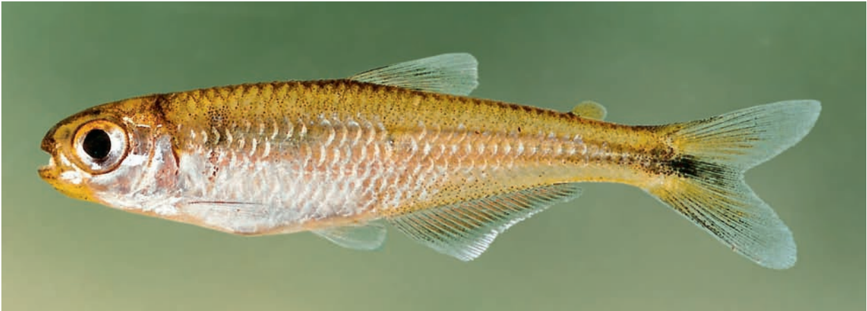
Fig. 3. Bryconamericus guyanensis sp. n., lateral view, not preserved. Fleuve, Mana, 1995.