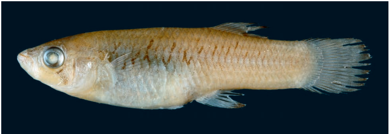
Fig. 2. Gambusia zarskei ; Mexico: Balneario San Diego de Alcalá, paratype, MTD F 31803, female, 28.6 mm SL.