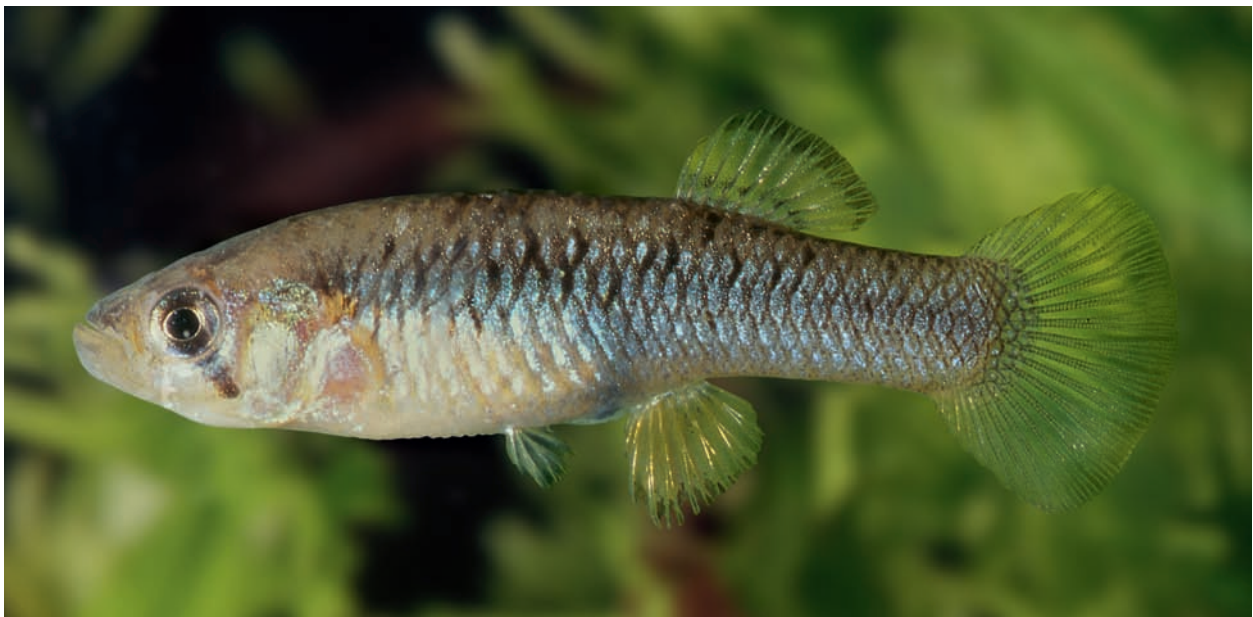
Fig. 5. Gambusia zarskei ; Mexico: Balneario San Diego de Alcalá, female.

developed spine series; distal spines of ray 3 very long, angular and projected beyond rays 4 to 5, 6 to 7 angulate spines long and pointed anterodistally, base of ray 3 somewhat tapered; ray 4a very short reaching to the middle of the large rounded terminal hook on ray 5a, ray 4a with an anterior swelling (elbow), elbow segments usually not fused, major elbow segment straight and not very long; ray 4p longer than 4a and terminating with a large rounded hook, 5 to 8 retrose serrae, the lengths much longer than the widths of their bases; ray 5a shorter than ray 4p and longer than ray 4a. Ray 6 and 7 straight, ray 6 thickened distally.