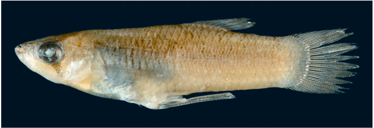
Fig. 1. Gambusia zarskei ; Mexico: Balneario San Diego de Alcalá, holotype, MTD F 31802, male, 23.1 mm SL.