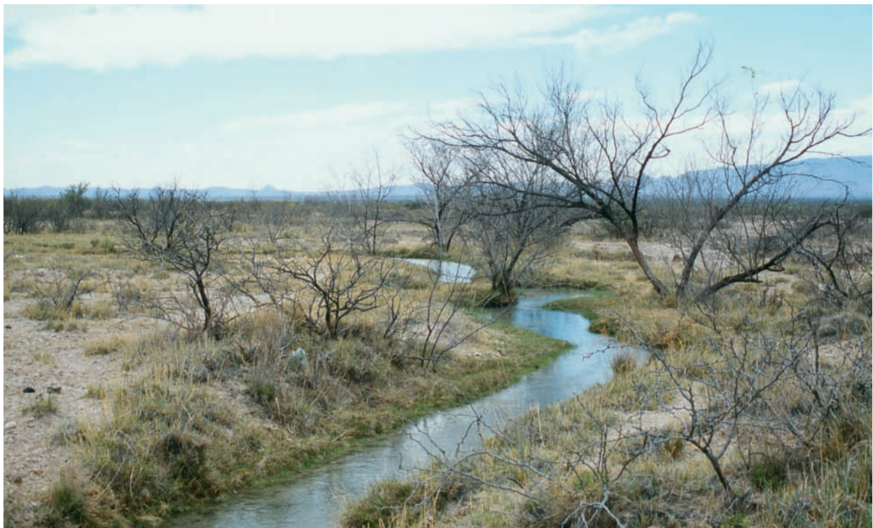
Fig. 7. Habitat: Outlet of Balneario San Diego de Alcalá, type locality of G. zarskei .

well in the range of what has been reported for species of the genera Xiphophorus (MEYER & SCHARTL, 2002, MEYER & SCHARTL, 2003), Poecilia (MEYER, SCHNEIDER, RADDA, WILDE & SCHARTL, 2004) and Priapella (SCHARTL, MEYER & WILDE, 2006).