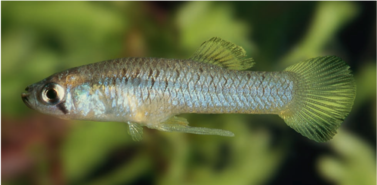
Fig. 4. Gambusia zarskei ; Mexico: Balneario San Diego de Alcalá, male.