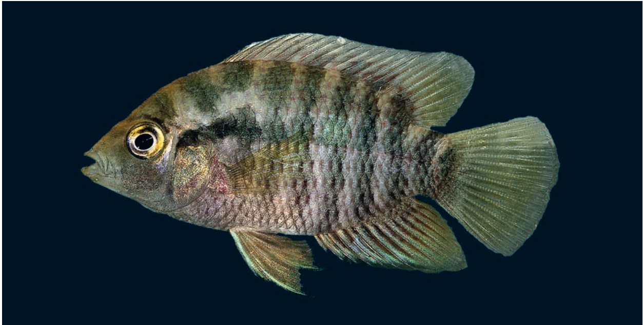
Fig. 1. Australoheros capixaba , sp. n.; Holotype, UFRJ 7725, 57.4 mm SL; Brazil: Estado do Espírito Santo: rio Barra Seca basin.