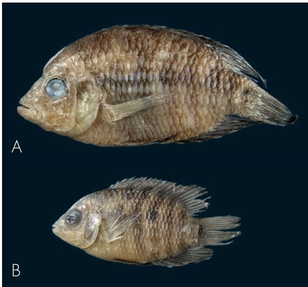
Fig. 2. Australoheros perdi sp.n.: Brazil, Minas Gerais state: Marliéria municipality: lacustrine region of the middle Doce River basin, Doce River Valley, Parque Estadual do Rio Doce, Lagoa Gambazinho, 19° 47' 10,6" S, 42° 34' 48,3" W. A, UFRJ 7912, 88.4 mm SL (paratype) and B, UFRJ 7911, 44.5 mm SL (paratype).

Comparative material is listed in OTTONI (2010), OTTONI & CHEFFE (2009), OTTONI & COSTA (2008), OTTONI et al. (2008) and SCHINDLER et al. (2010). Comparisons with Chromys oblonga CASTELNAU, 1855 and Heros autochthon GÜNTHER, 1862 were based on CASTELNAU (1855) and GÜNTHER (1862).