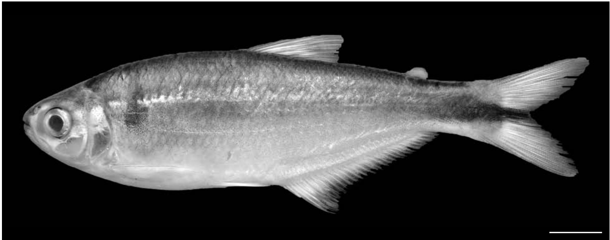
Fig. 1. Hemibrycon palomae sp. n., holotype: IUQ 2727, male, 65.9 mm SL, Colombia, Quindío, Quimbaya, Mountain El Ocaso natural reserve, Cauca–Magdalena River Basin, Roble River drainage, La Paloma Creek. Scale = 1 cm.

scales (44–51 vs. 34–44, except H. colombianus with 45–54 and H. cairoense with 43–46). It also has a higher number of scales: between the lateral line and the anal-fin origin (5–9 vs. 4–5, except H. paez with 6–7, H. colombianus with 7–9, H. polyodon with 6–7, H. orcesi with 4–7, H. huambonicus with 8–9 and H. coxei with 7); and also more scales between the lateral line and the insertion of the pelvic fin 5–6 vs. more than 6, except in H. yacopiae with 4–6, H. polyodon with 5–6, and H. orcesi with 4–6). Hemibrycon palomae also has fewer circumpeduncular scales 13–14 (vs. 18–20). It also differs in having a reddish spot present on both the dorsal and ventral margins of the caudal peduncle instead of just on the ventral margin as is the case for all other Hemibrycon species.