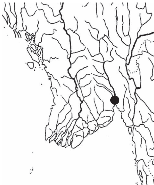
Fig. 6. Collecting site of Badis juergenschmidti sp. n. in Myanmar.

The species of Badis are easily separated from species of the genus Dario by the presence of tube-bearing scales in the lateral line (versus absence of bony tubes in Dario ) and a shorter pelvic fin in males (pelvic fin not reaching beyond the anterior base of anal fin versus pelvic fin in males reaching beyond the anterior part of anal fin in Dario ). Following these character sets B. juergenschmidti fits the genus Badis .