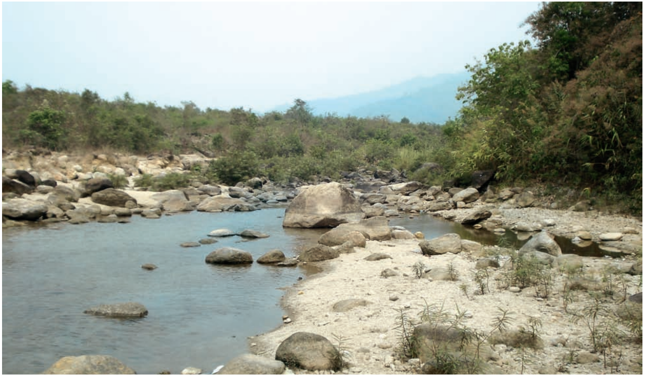
Fig. 7. Habitat (type locality) of Badis juergenschmidti sp. n.

Before the comprehensive revision of Badidae by KULLANDER & BRITZ (2002) was published, only 3 different species were recognized as valid within Badis . The revision revealed the large diversity of this genus. As pointed out and discussed by REIS (2004) such revisions are not only an inventory of the current knowledge, but also provide an important source for the discovery and description of additional species in subsequent studies. The herein described species, B. juergenschmidti , lifts the number of species taxa in the genus to 15. This, however, does not complete the picture of species richness in the genus Badis . We know of several forms which seem to be distinct from hitherto described species. These are often well-known both in the aquarium hobby and popular literature (see VAN DER VOORT, 2009), but lack of sufficient material prevents their formal description.