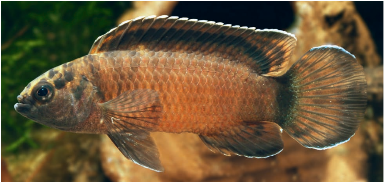
Fig. 4. Colouration in life of Badis juergenschmidti sp. n. (male) with reduced bar pattern.