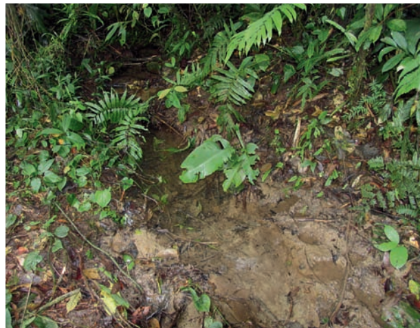
Fig. 4. Habitat (type locality) of Rivulus parlettei .