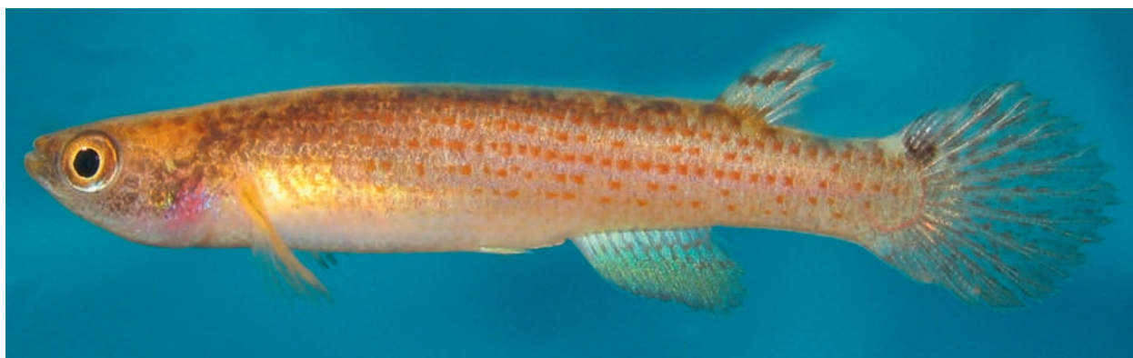
Fig. 8. Rivulus christinae , female, Peru, río Manuripi drainage.