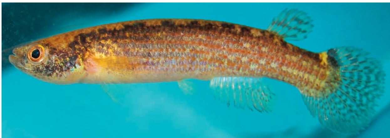
Fig. 6. Rivulus christinae , female, Peru, río De Las Piedras drainage.