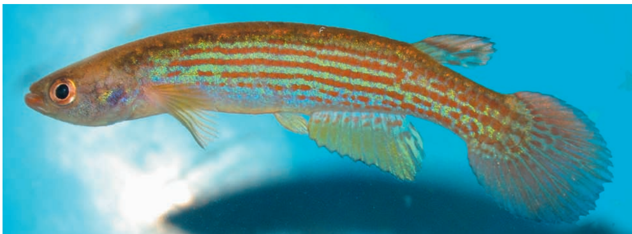
Fig. 5. Rivulus christinae , male, Peru, río De Las Piedras drainage.