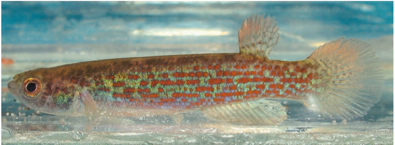
Fig. 1. Rivulus parlettei , MUSM 39906, male, holotype, 37.7 mm SL, Peru, río Araza drainage.