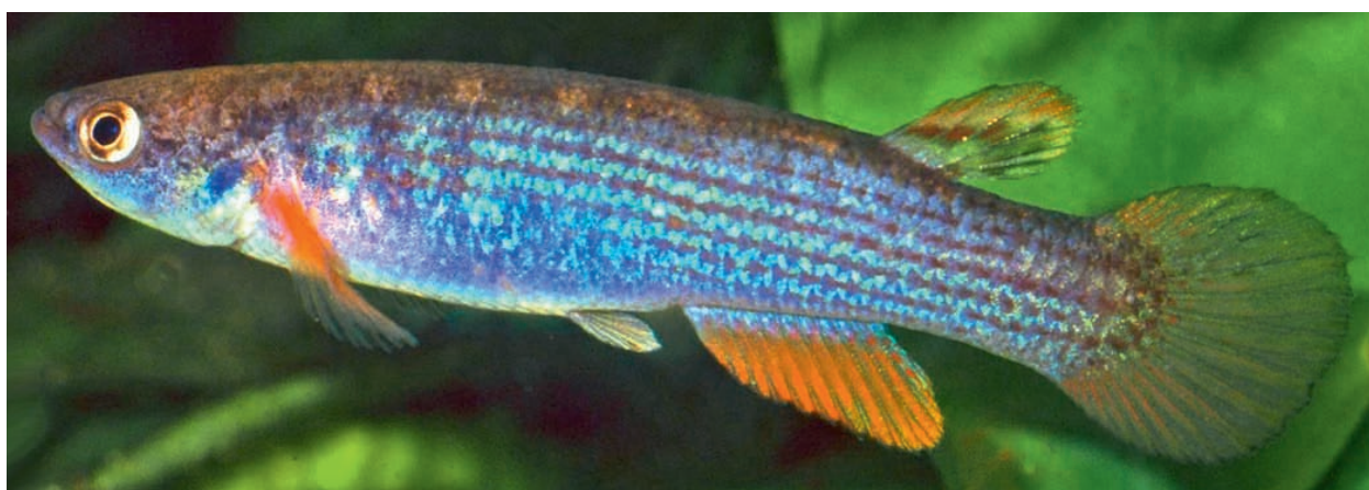
Fig. 9. Rivulus christinae , male, Peru, río Tambopata drainage.

tween these rivulids because of their phenotypically similarity and their variation even at population level. In this study we recognise the R. limoncochae group as a taxonomic unit only because it allows a better handling of the subsets of the subgenus and we do not consider it as a phylogenetically robust clade.