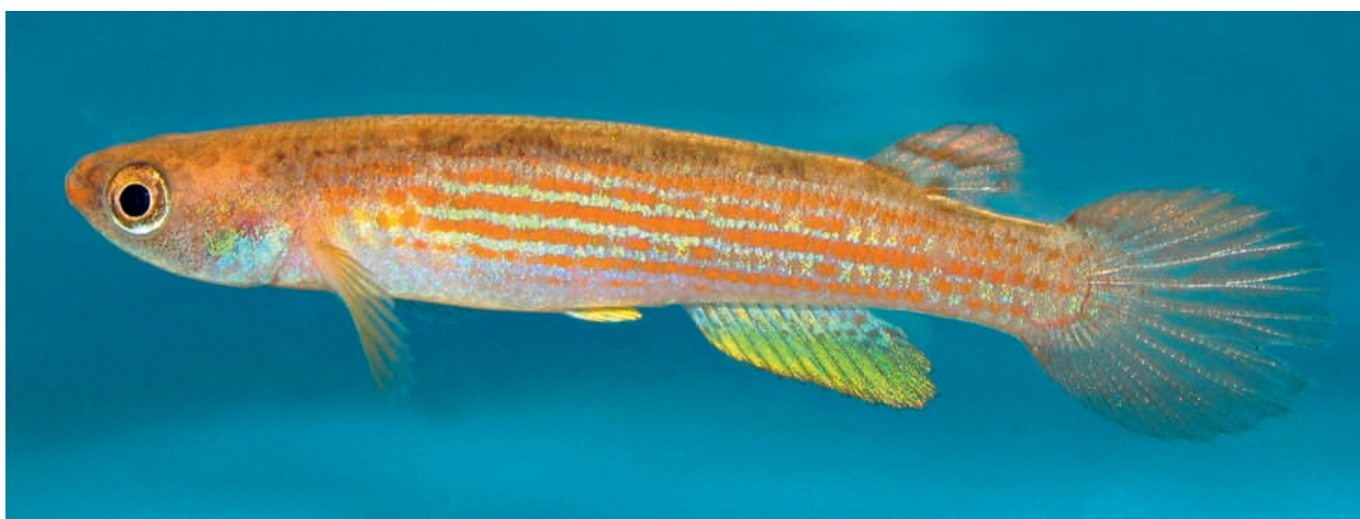
Fig. 7. Rivulus christinae , male, Peru, río Manuripi drainage.

parts of the Amazonian drainage. He discriminated this group from the urophthalmus group by the possession of contact organs on the flanks of males (versus contact organs absent) and by the presence (versus absence) of an oblique transverse stripe on the