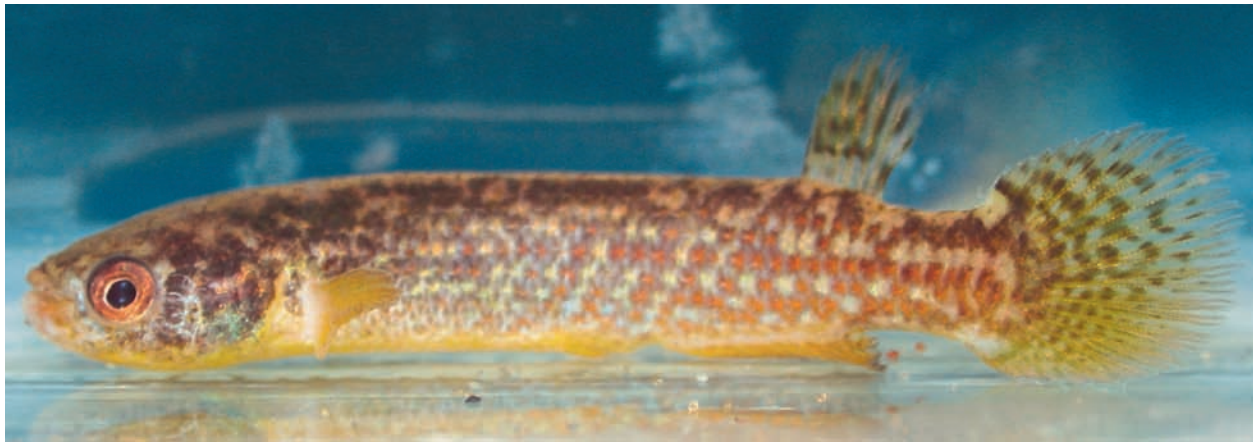
Fig. 2. Rivulus parlettei , female Peru, río Araza drainage.

Colouration. Body sides of males (Fig. 1) metallic green-yellow, dorsolateral portion of body between postorbital region and anterior portion of flank pale brownish with dark brown mottling; broad interrupted lines comprised of red dots on entire flank. Dorsum brownish. Venter light blue. Opercular region green-yellow. Ventral part of head light blue. Upper jaw light brown, lower jaw dark brown. Iris yellow. Dorsal fin pale yellowish with a transverse red stripe and short oblique red bars on posterior portion. Anal fin pale yellowish, base whitish with red spots on posterior portion. Caudal fin pale yellowish to hyaline on posterior margin and with red spots on proximal portion. Pelvic fins yellowish. Pectoral fins yellowish to hyaline. Body sides of females (Fig. 2) light yellow, with irregular dark brown mottling and orange spots and oblique marks of variable shape, forming three irregular lines on caudal peduncle. Dorsum brownish. Venter orange yellow. Opercular region with large dark brown blotch. Ventral part of head yellow. Upper jaw light brown; lower jaw yellow. Iris yellow. Dorsal fin hyaline to pale yellow-