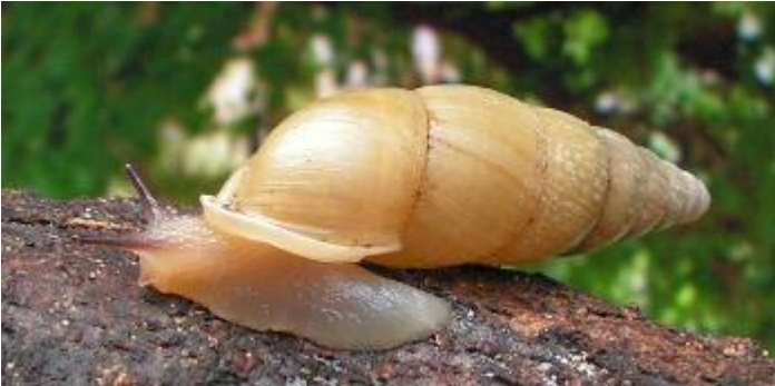
Synprosphyma basilissa (Boettger & Schmacker)

Clausiliidae are a speciose family. The currently recognized taxa numbers are as follows: 9 living and 2 extinct subfamilies, 155 living and 29 extinct genera, 1278 living and 156 extinct species.