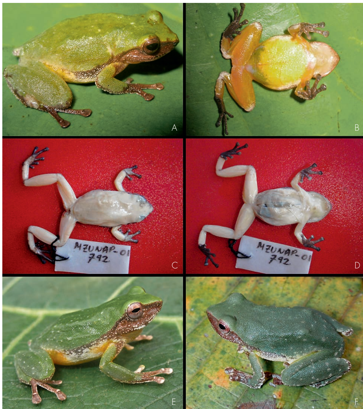
Fig. 1. Holotype of Pristimantis padiali sp. n. (MZUNAP-01-792) in life, (A) dorsal, and (B) ventral views. Holotype of P. padiali sp. n. (MZUNAP-01-792) in alcohol, (C) dorsal, and (D) ventral views. Referred adult specimens of P. padiali sp. n. in life, (E) NMP6F 16 from the type locality, and (F) NMP6F 18 from Puerto Almendras (Loreto, Peru).

FMNH 109829; San Jacinto, KU 221995 . San Martín: río Cainarachi, 33 km NE Tarapoto, on road to Yurimaguas, KU 209466 ; río Shilcayo, Tarapoto, KU 209467 ; 15.4 km SW Zapatero, KU 217308-10 .