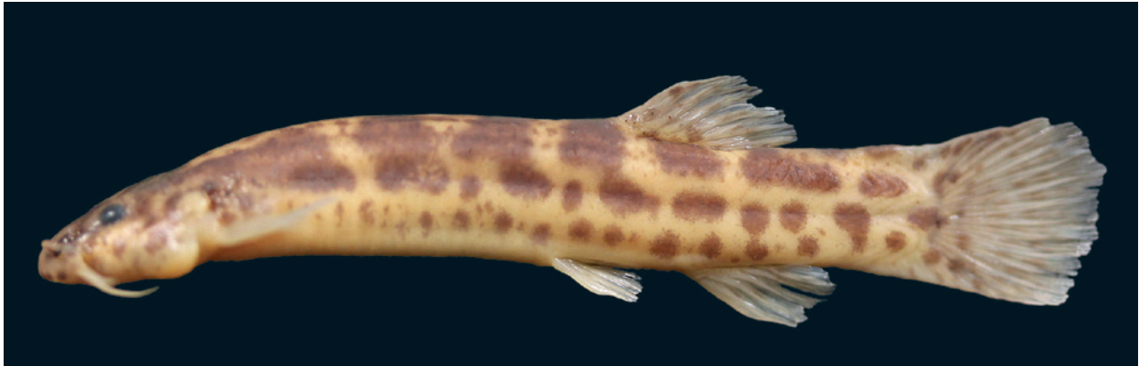
Fig. 1. Trichomycterus mimosensis , UFRJ 8156, preserved holotype, 50.8 mm SL; Brazil: Espírito Santo: Município de Mimoso do sul.