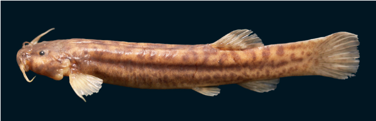
Fig. 3. Trichomycterus gasparinii , UFRJ 8157, preserved holotype, 84.5 mm SL; Brazil: Espírito Santo: Município de Fundão.

tine about equal in length to autopalatine without posterior process. Lacrimal about one fourth supraorbital length; supraorbital rod-shaped. Metapterygoid large, deeper than wide, without distinct processes. Anterodorsal surface of hyomandibula with weak concavity. Urohyal foramen rounded; distal portion of lateral arm of urohyal truncate.